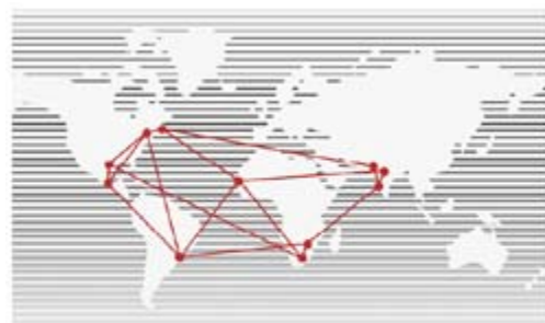
Networks: Discovering Shared Meaning and Purpose

Stage One: Networks. We live in a time when coalitions, alliances and networks are forming as the means to create societal change. There are ever more networks and now, networks of networks. These networks are essential for people finding likeminded others, the first stage in the lifecycle of emergence. It's important to note that networks are only the beginning. They are based on self-interest--people usually network together for their own benefit and to develop their own work. Networks tend to have fluid membership; people move in and out of them based on how much they personally benefit from participating.